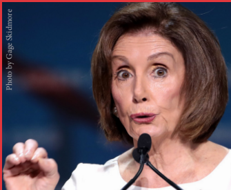
Nancy Pelosi 34 Years in Congress

They have good reason to demand Term Limits. The growth of Big Government has gone hand in hand with the increasing length of service in Congress. Look at who is running Washington: