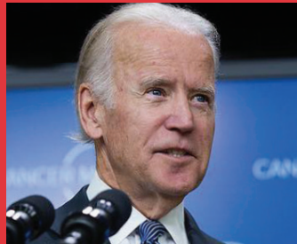
Joe Biden 44 Years in Washington