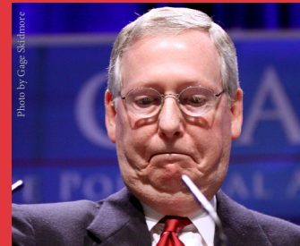
Mitch McConnell 36 Years in Congress